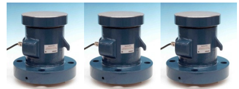
(3 Static Compression cell System)